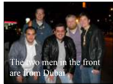
The two men in the front are from Dubai

Pray for those that were saved during this time. Pray they will continue to seek after God and be led to good Bible preaching churches in their area. There is such a great need all over the world for