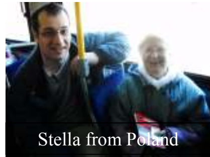
Stella from Poland

express the thrill it was to have a small part in this monumental task. Only eternity will tell what was really accomplished as we dealt with tens of thousands of people in just two weeks time. Pray that the scriptures that were taken back to all these countries would not only impact the people that received